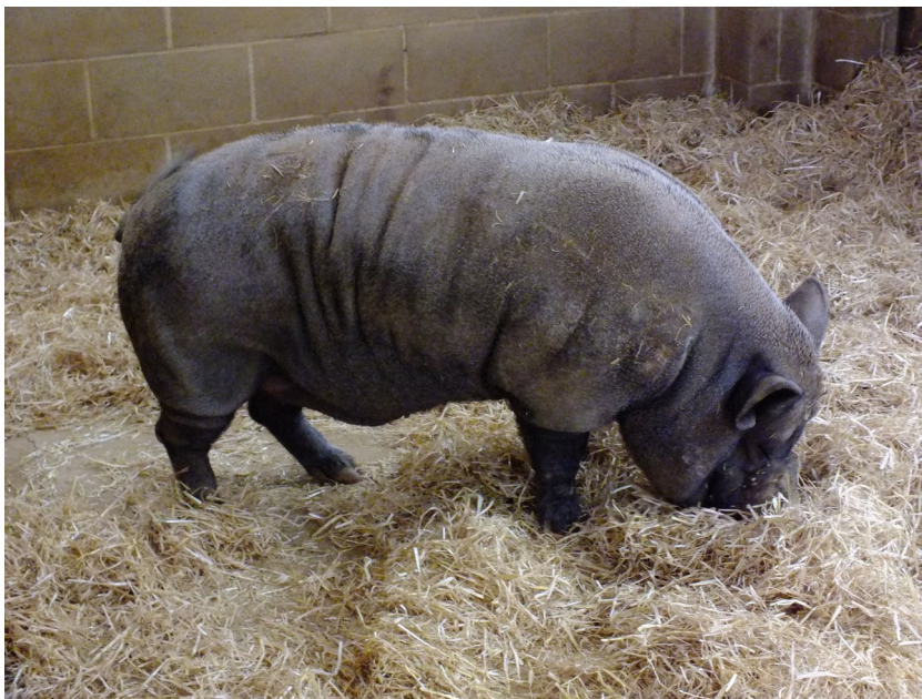
Vietnamese pot-belled pig – This is a photo I took at Cotswold Country Park

Finally, why not have some fun and get rid of the dog and get yourself a new pet and companion instead. On the pet side of things the Vietnamese pot-bellied pigs who with their appealing wrinkled faces and intelligence can become very much part of your family. They are the ultimate pet pig and very affectionate. They have the same basic needs as all pigs and the same rules and regulations – so go on and treat yourselves.