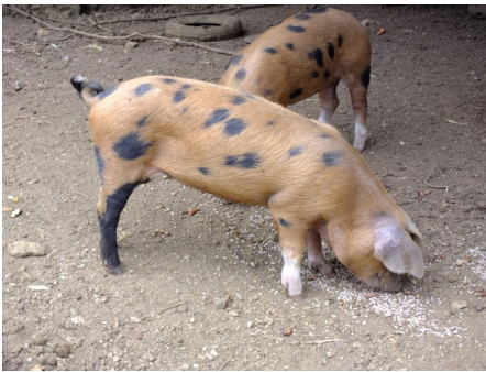
Gloucester Old Spot

The Gloucestershire Old Spots (GOS) breed society was formed in 1913, the originators of that society called the breed Old Spots because the pig had been known for as long as anyone could remember. The first pedigree records of pigs began in 1885, Much later than it did for cattle, sheep, and horses because the pig was a peasant's animal, a scavenger and it was never highly regarded. No other Spotted breed was recorded before 1913, so today's GOS is recognised as the oldest such breed in the world from the British Pig Association, although there have been spotted pigs around for two or three, centuries, GOS has only had pedigree status since the early 20 th century.