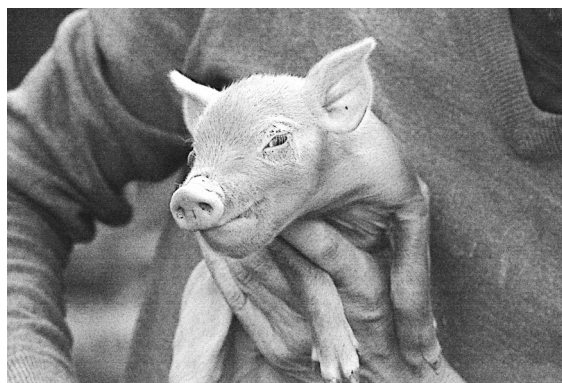
These rather cute little Tamworth piglets – are just a few hours old

The cottages pig kept in a stone sty near to the house eating scraps from the kitchen, was a common site up until the 1950's. Now it is more difficult to keep pigs this way. Feeding waste to pigs is strictly controlled and meat is never allowed, and neighbours usually prohibit the keeping of the pig nearby. But if you have a good-sized garden, with a large airy stone building or room for a modern pig arc and no near neighbours, then pig keeping may be for you. Pigs can provide bacon and pork for your freezer, but also pigs can be pets and also provide companionship. They can help gardening by providing manure to compost for vegetable gardens, and they are delighted to help you turn over rough ground. Pigs, if well kept, are clean and straightforward to look after. But there is no doubt that pigs have a pungent smell, even if kept very clean. Which is a constant sharp reminder about 25 years ago when we both moved to Tostock there was a pronounced nasty smell which hung in the air over the entire village especially when the wind was in the wrong direction, likewise known by the locals as the 'Woolpit Whiff'. So you need to be prepared for this. Choice of breed is important as commercial pigs get absolutely huge so the garden pig needs to be from a relatively small breed such the Berkshire or the traditional cottages pig, the Gloucester Old Spot.