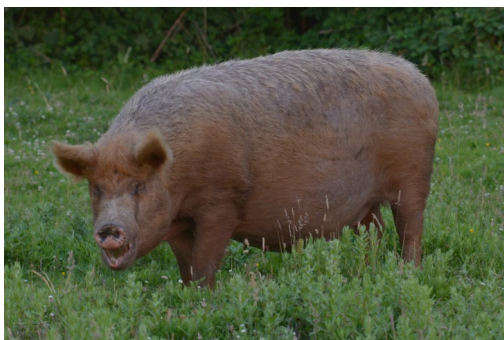
Tamworth picture taken at Knepp Re-wilding

The British Saddlebacks are hardy and noted for their mothering ability. The breed is known for its grazing ability, it has secured a niche in outdoor and organic production. These are docile pigs making them more manageable more than some. They are liked by many as they are attractive pigs and because they are bigger than some of the breeds. They produce good bacon. The fine and sturdy Saddleback is an amalgamation of the Wessex and Essex Saddlebacks and is hardy, lop-eared and impressively deep-bodied. They are naturally good mothers and have an easy non-aggressive temperament, in no rush to do anything and take everything in their stride.