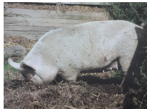
British Landrace breed large white

The Tamworth's red/gold hair makes it as one of the most recognisable of the traditional pig breeds. It is thought to be most typical breed descended from the old indigenous species, old English forest pig. The sows are excellent mothers, being milky, docile as well as protective. The Tamworth is hardy and can be kept in environments ranging from rough pasture to meadowlands.